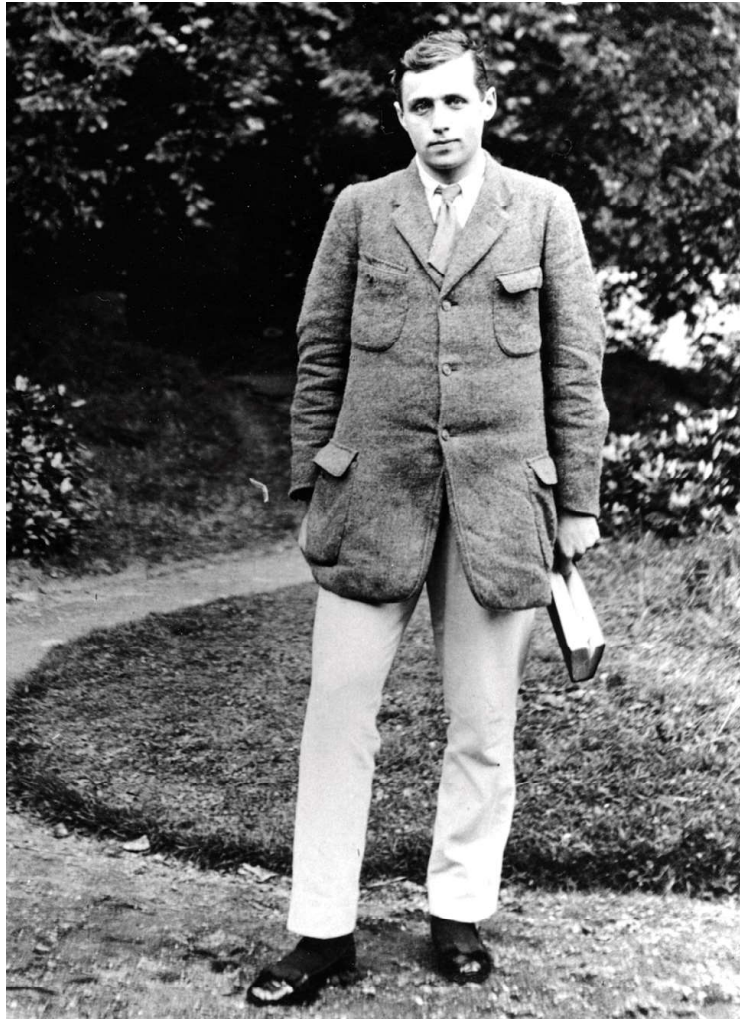
Figure 1. A young Kurt Hahn.